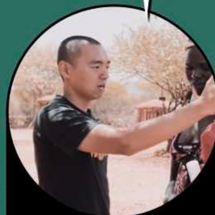
楊右任 弟兄 YU-JEN YANG