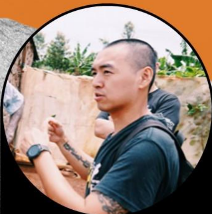
楊右任 弟兄 YU-JEN YANG