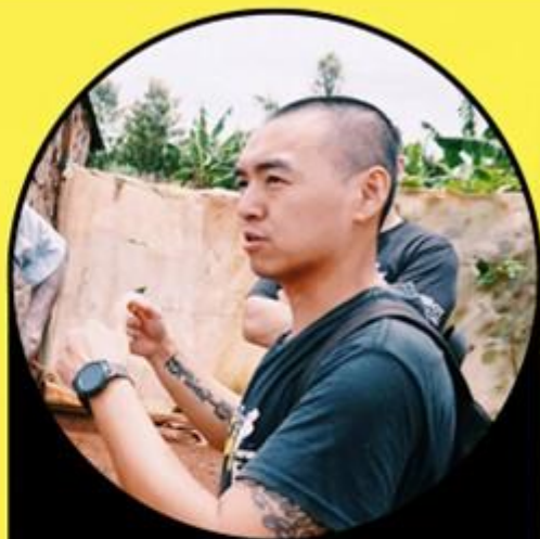
楊右任 弟兄 YU-JEN YANG