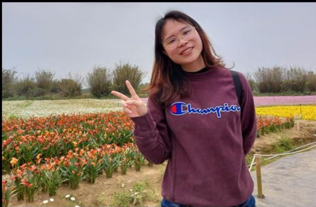
劉 藝 姊妹