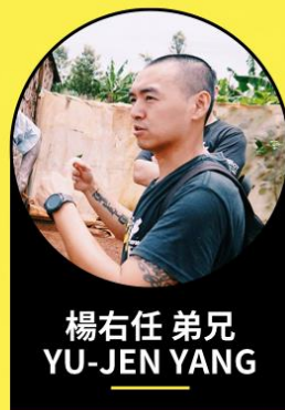
楊右任 弟兄 YU-JEN YANG