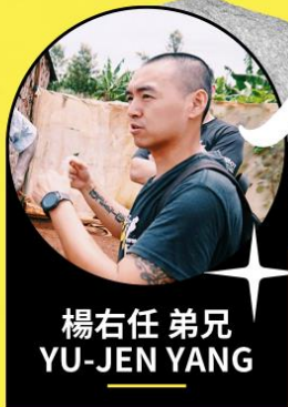
楊右任 弟兄 YU-JEN YANG